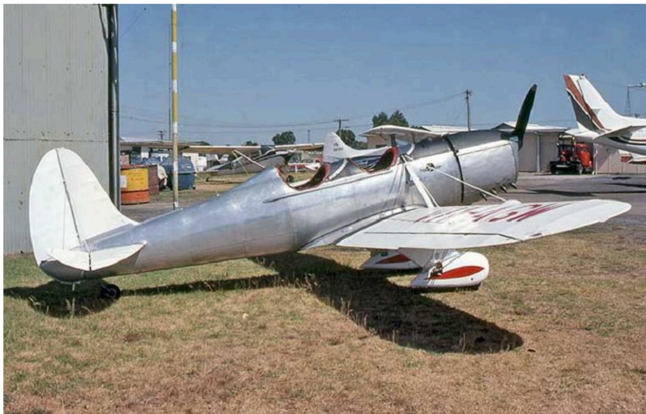
VH-AGW at Moorabbin January 1982, back to original Menasco engine.