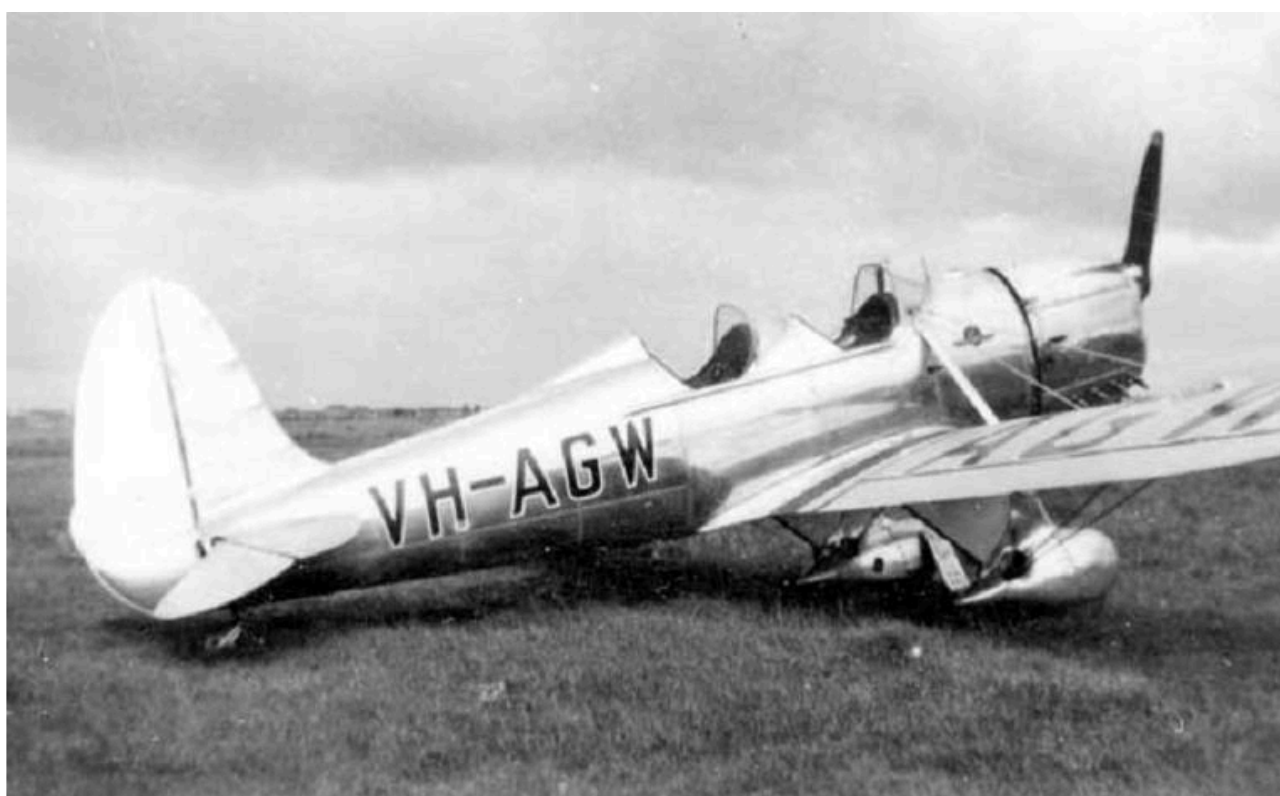
Fishermans Bend Vic 29 May 1948, in standard Brown & Dureau scheme.