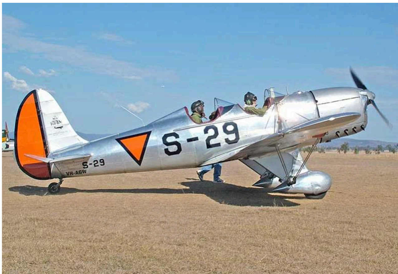
VH-AGW at Watts Bridge Qld August 2004, restored to Dutch markings.