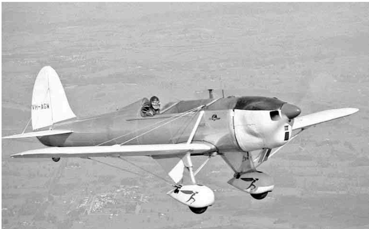
Lycoming engine, custom-built cowling, front cockpit covered.