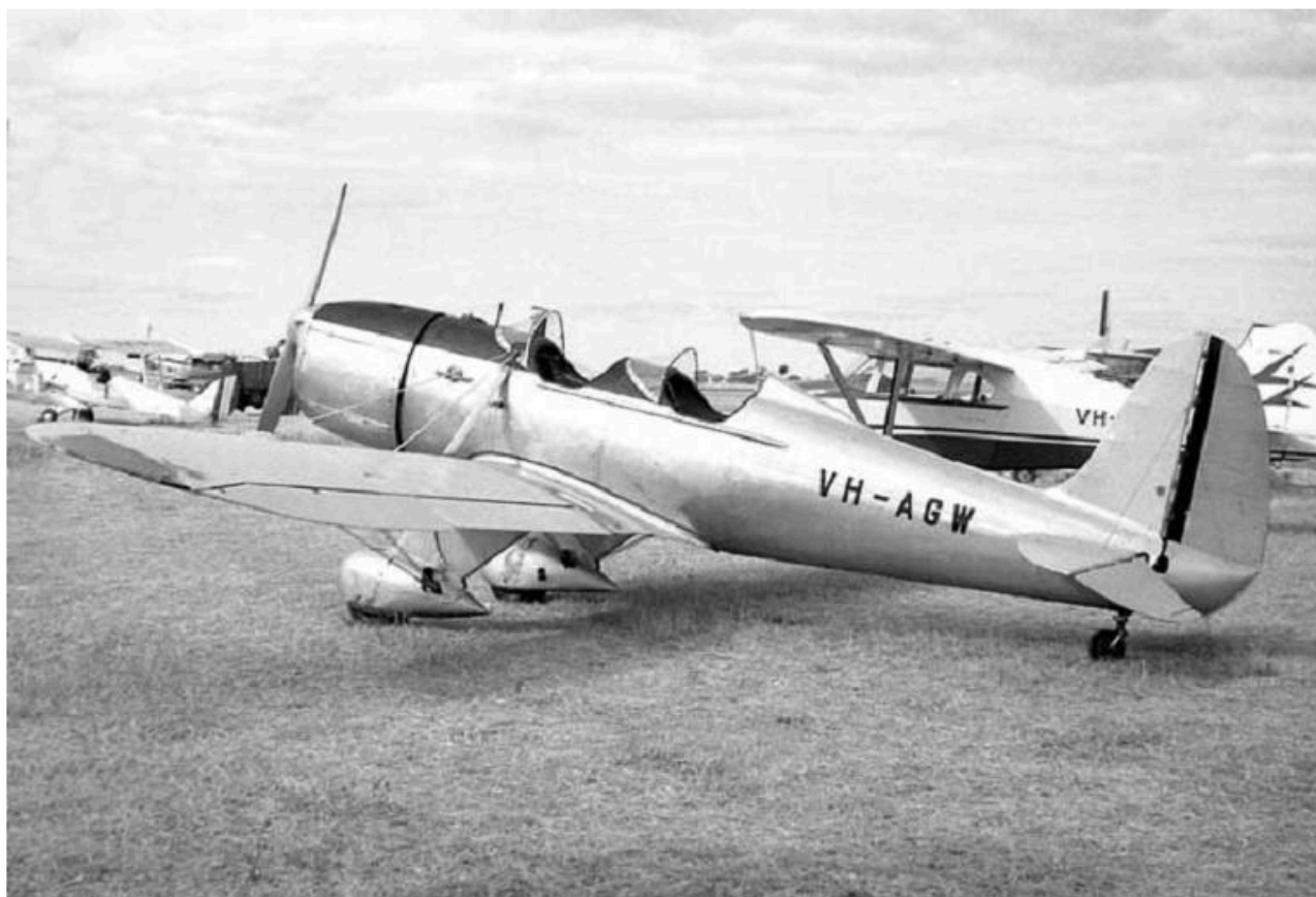
Visiting an airshow at Horsham Vic March 1965 from its owner's farm at Edenhope.