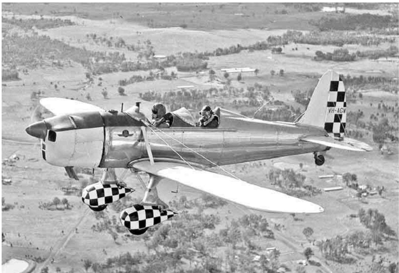
A fine view of VH-AGW, in full display paint scheme.