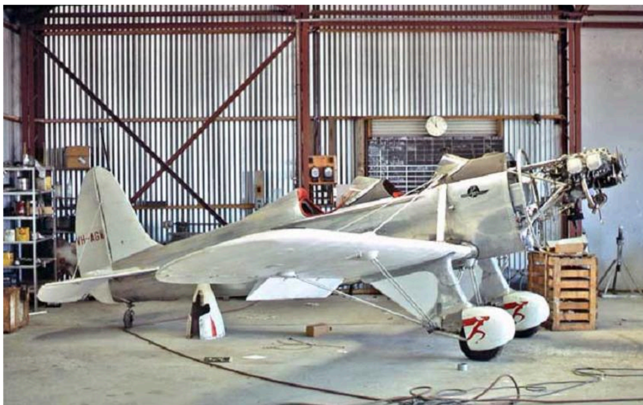
Moorabbin, August 1968 having the Lycoming flat four engine installed.