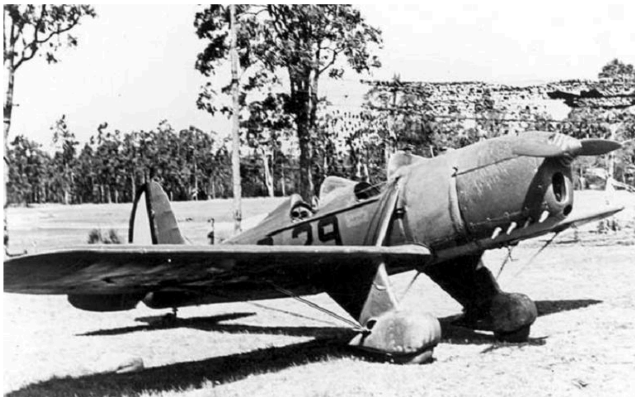
S-29 in Australia 1942, location unknown, still in Dutch markings.